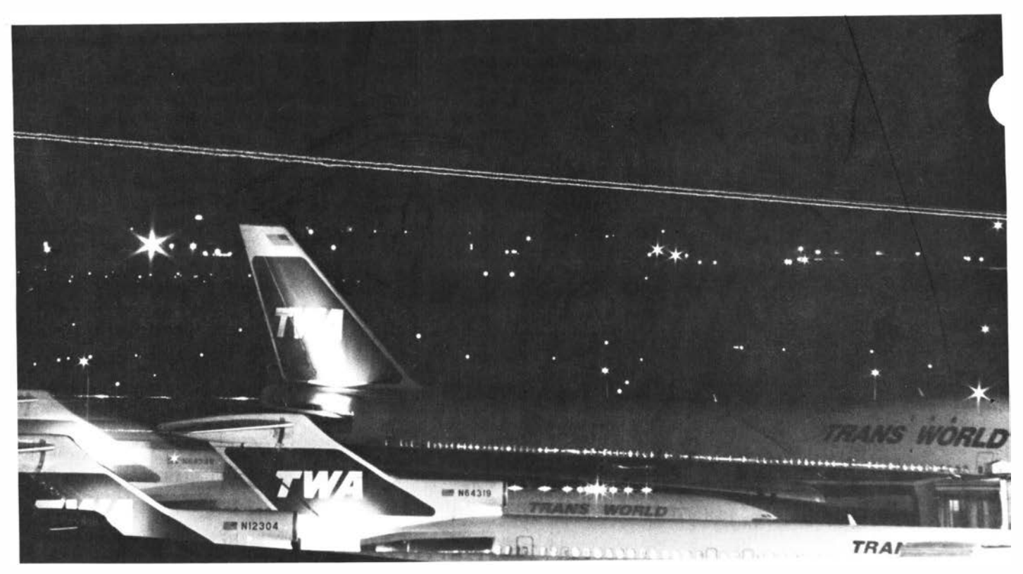
A crowded terminal at Chicago-O'Hare and the light track of an aircraft.