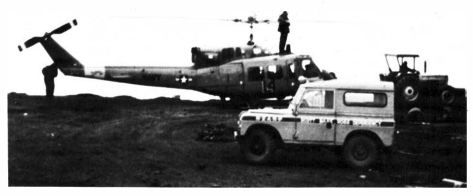
A Navy helicopter at McMurdo Station on Ross Island is rolled out to prepare for takeoff. The LN-1s serviced the investigation team and scientific expeditions in the area.

soon as possible. We wanted to do this for two reasons. First, if the tapes were unreadable then a more detailed investigation would have to be conducted at the scene under adverse conditions. Secondly, the additional personnel brought about by the accident were taxing the accommodations at McMurdo.