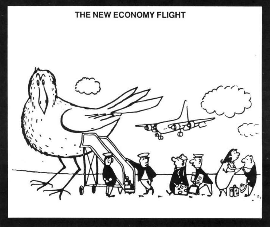
(Our thanks to Lufthansa German Airlines for sharing this cartoon with us.)

Human Affairs Alaska 4300 B Street, Suite 606 Anchorage, AK 99503 Phone: (907) 562-2812 Outside Anchorage: Call 1-800-478-2812