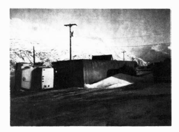
A tractor trailer loaded with furniture catapulted to its side on a Valdez street.

A small pickup camper was unable to withstand wind blasts in the Valdez airport parking lot.